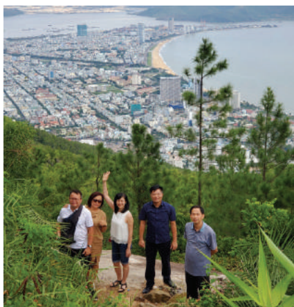
WMU graduates 2000 and 2001 with their beloved on the top of Vung Chua Mountain.

The year 2020 has been a most challenging year for the world, which is facing a corona virus pandemic that has stolen millions of life worldwide. The COVID-19 pandemic has had a significant impact on the economy, but we must stay strong and positive in order to move on.