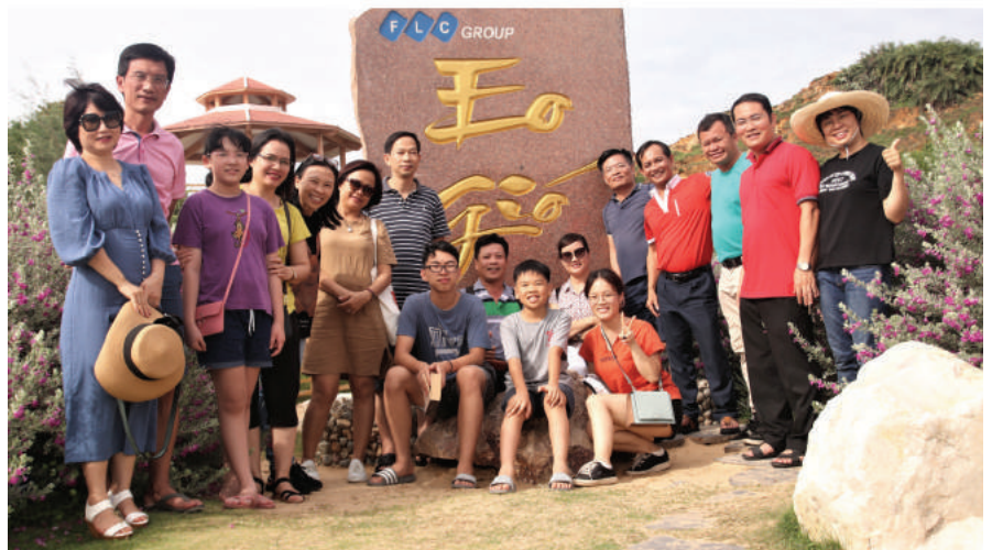
WMU graduates together with families at Eo Gio.

Beautiful memories of Sweden flow inside our minds. Despite the restrictions necessitated by the COVID-19 pandemic, we celebrated 20 years since our graduation from WMU in Quy Nhon.