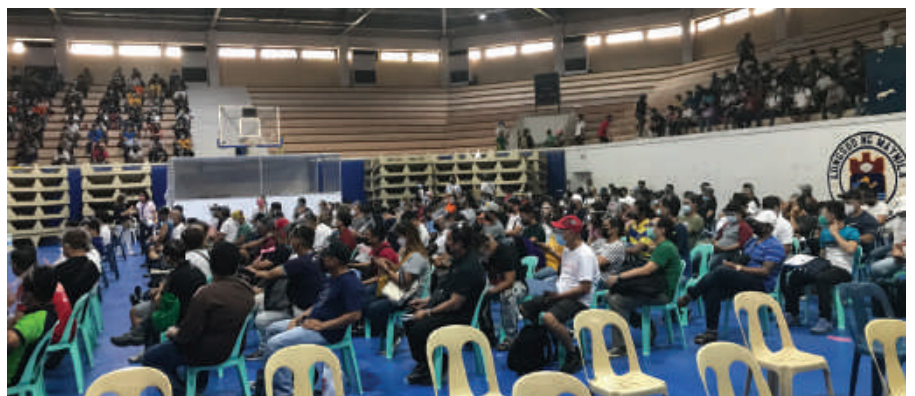
Seafarers and their families waiting to receive their COVID-19 vaccines in Manila.

Lastly, I hope readers of this article are in good health and staying safe from COVID-19.