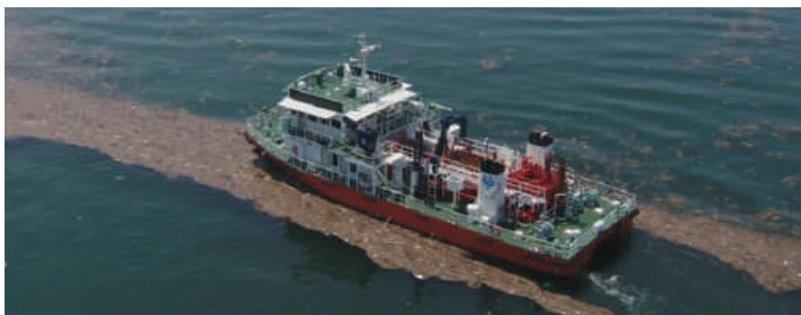
Vessel for collecting marine debris

Vision", which clearly states the importance of not only stopping the discharge of waste into the ocean but also undertaking lateral efforts transcending social systems in which there is a diversity of stakeholders, 3 including national/regional governments, the private sector, the general public, NGOs, and academia.