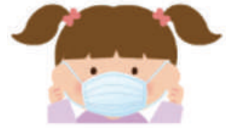
Illustration is from the Japanese Ministry of Health, Labor and Welfare website.

I first heard about COVID-19 around January 2020, when the Japanese authorities issued a warning against this virus.