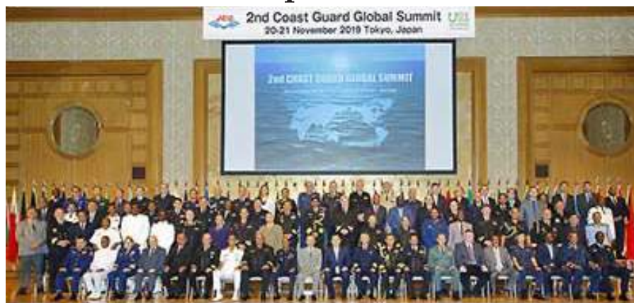
Group photo of the Second Coast Guard Global Summit

The history of coast guard systems is relatively short, and their organizational forms vary from country to country. In November 2019, the Japan Coast Guard and the Nippon Foundation co-hosted the second Coast Guard Global Summit (CGGS) in Tokyo. Alongside independent