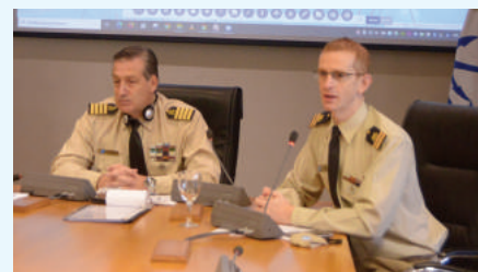
Author speaking to the right.

Due to the positive results of this event, our institution was invited to be part of project CAPFISH, whose main objective is to foster capacity-building for professionals in the maritime and ocean fields in developing countries, with the financial support of the Korean Government. This project comprised two workshops involving multiple organizations, including IMO, ILO, and FAO. For the first workshop, which was held October at WMU, I was invited as an expert representing the