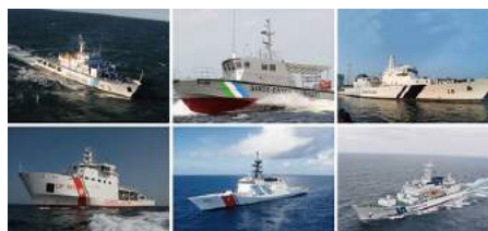
Top row, from left: Argentine Coast Guard, Djibouti Coast Guard, Indian Coast Guard, Italian Coast Guard, U.S. Coast Guard, Japan Coast Guard

This article was originally featured in Issue 507 of the Ocean Newsletter, a publication by OPRI, and edited with the cooperation of the author. See the following link for the full English article which will be posted on OPRI's website: https://www.spf.org/en/opri/projects/information~selected.html