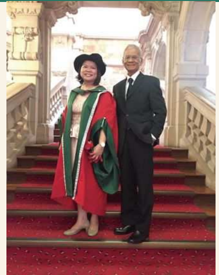
At Cardiff University on 21 July 2017 during my graduation.

As my responsibilities increased when I was