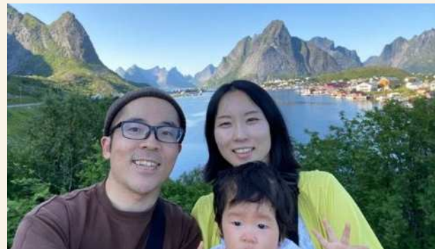
Family photo with a beautiful Fjord backdrop

It wasn't just my Norwegian friends who gave me a warm reception; the great nature of Norway welcomed me and my family with open arms. As you may already know, Norway is a country with