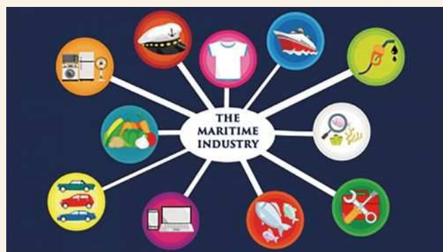
Maritime industry overview.

The maritime industry needs to address the undervaluation of seafarers due to poor visibility of the shipping industry in the world, also known as sea blindness. According to George (2013): "Ship-