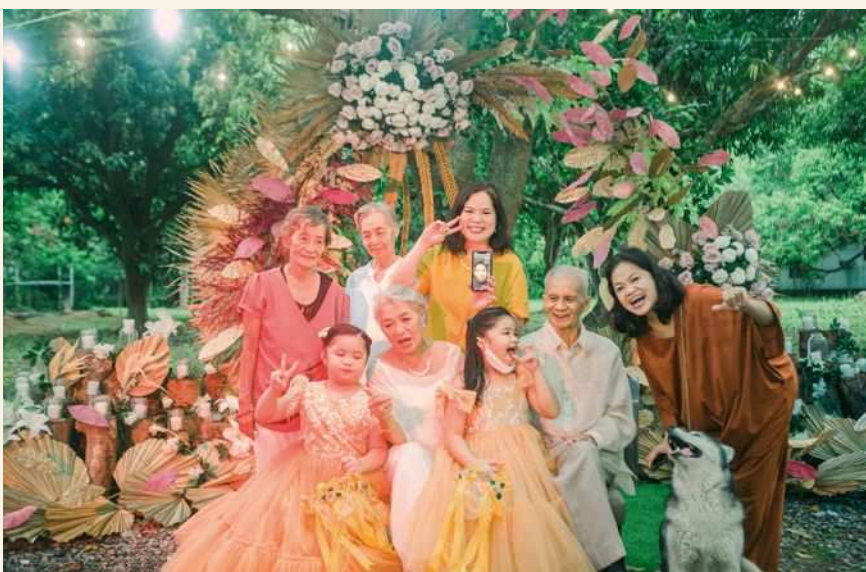
During the celebration of the 50th wedding anniversary of my parents last 6 June 2021 at the Pia Farm.

"I am especially thankful for the schol-