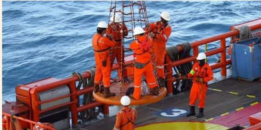
Seafarers working onboard.

The resources allocated for the security, safety, wellbeing, development, and rights of people engaged in the maritime industry, especially sea-