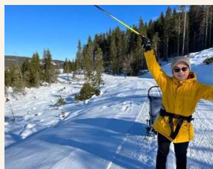
Cross-country skiing in snowy mountains

In May 2020, in the middle of the COVID-19 pandemic, I moved from Tokyo to Oslo. This was when I started my life as a diplomat in the Japanese Embassy in Norway, with Oslo becoming my second Nordic hometown after Malmö, Swe-