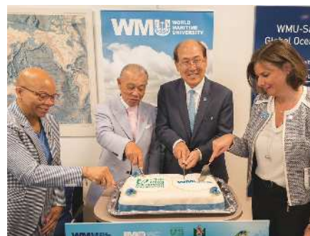
At the inauguration of the WMU-Sasakawa Global Ocean Institute, 2018

At this point, the Government of Sweden moved forward with the change in the national legislation that was necessary in order that the UKÄ recommendation could be implemented. The legal amendment was drawn up and went through the consultative procedures required under the Swedish Constitution. On 1 December 2021, WMU accreditation was formally debated in the Swedish Parliament. The accreditation motion before the Parliament was passed with overwhelming support: 283 voted in favour of the amendment, with only 24 against it and 42 abstentions. The revised legislation permitted IMO, through WMU, to award degrees