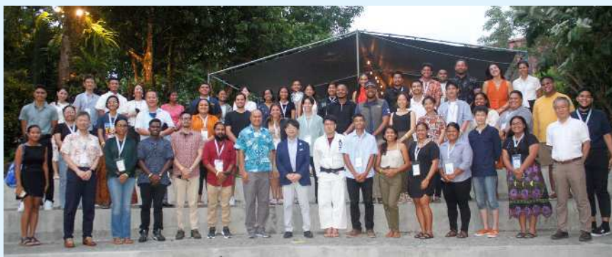
Youth Leadership Summit participants together with members of the Sasakawa Peace Foundation.

This OOC held in Palau was unique in three ways: 1) Balancing economic recoveries from the COVID-19 and ocean conservation; 2) Climate crisis measures and actions that utilize the ocean and the coast; and 3) The presence of youth leaders. For small island states and developing coastal countries, where ocean-based tourism and fisheries are important sources of income, the impact of the prolonged pandemic on tourism has worsened the economic situation, and discussions were centered on how to increase production from the sea to protect people and their livelihoods, as well as preserving the ocean. The phrase "protect, produce,